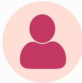
SENIOR PROPERTY MANAGER