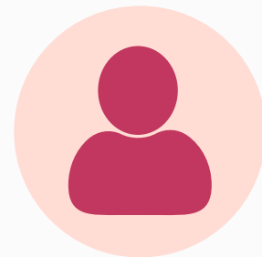
JUNIOR PROPERTY MANAGER