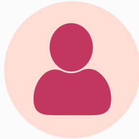
SENIOR SALES ADMIN